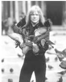
Musician click to enlarge